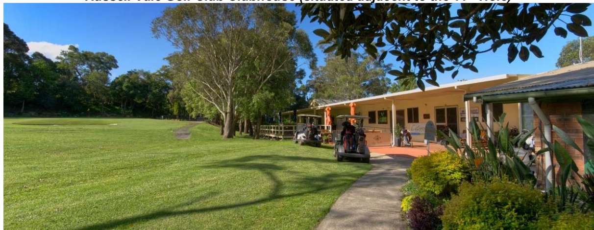
Russell Vale Golf Club Clubhouse (situated adjacent to the 11 th Hole)

Playing Fees are detailed on our website. It is important to note that of the amount paid to participate in Club competitions through the Wollongong City Council run Pro Shop, only $8.00 is passed on to the Club. The $8 is utilised for Ball Competition, NTP competition, pro-shop starter's fee, council development levy, leaving a small amount for pooling and distribution of competition prizes.